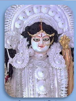
Saraswati Puja 14-15 February, 2024